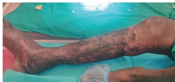
Fig. 4: Scar area at the time discharge. Scar improved well. VSS score at the time of discharge is 7/13 and video dermatoscopy shows improvement of scar.

contact delivery) with 60 cm distance between laser source and the scar. Scar received laser therapy for duration of 125 second every time for 15 minutes for 4 sessions, 1 week apart and Vancouver Scar Scale composed of vascularity, pliability, pigmentation and height of the scar was calculated. Total score of VSS 13 which was suggestive of bad scar. In our case, initial VSS score was 13/13.