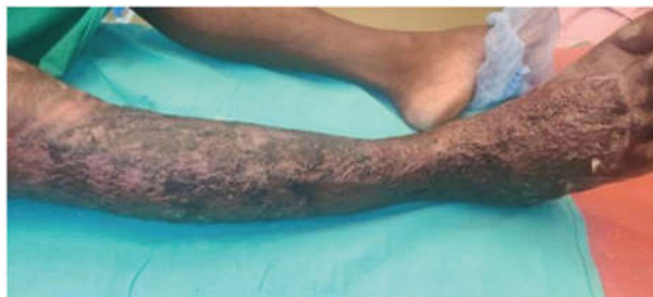
Fig. 1: Scar at the time of presentation