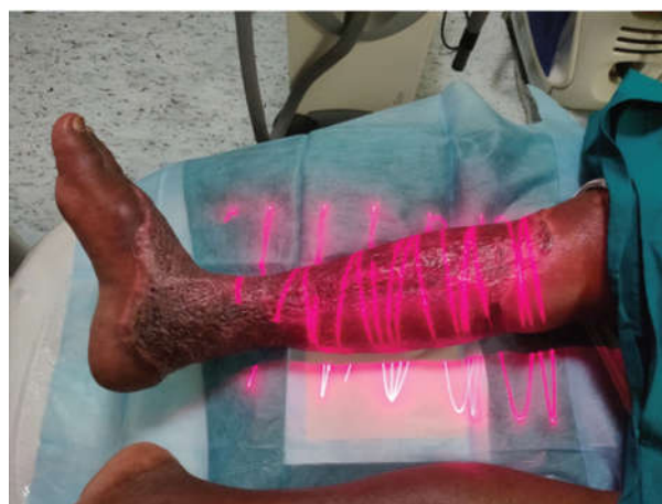
Fig. 3: Application of low level laser therapy on scar site

The study was conducted in tertiary care level plastic surgery department after getting consent from the patient. The details of the patient as follows: 40 year old male with known diabetic for 10 years on treatment presented with post soft tissue infection raw area. Wound healed with bad scar (Fig. 1). Video dermatoscopy (Fig. 2) and Vancouver scar scale (VSS) used to asses the scar scale. Score was calculated to know extent of scar. LLLT was given to the scar in four sessions once a week for a total of four session. (Fig. 3) Wound inspection and dressing done after each session. Low level laser source we used was Gallium Arsenide (gas) diode red laser of wavelength 650 nm, frequency 10 KHZ and output power 100 mw, which was a continuous beam laser with an energy density of 4 J/cm2. Machine delivers laser in scanning mode (non-