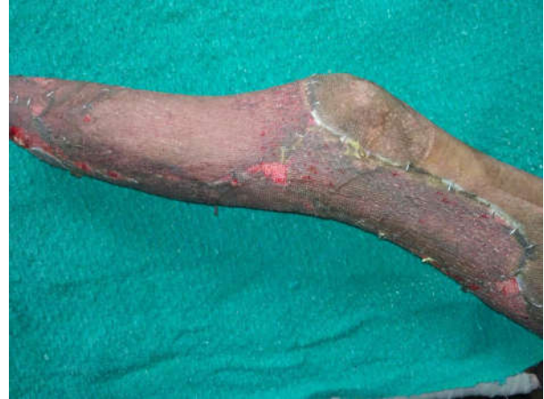
Fig. 8: Post Operative Day 7: Showing Almost 97% Graft Take