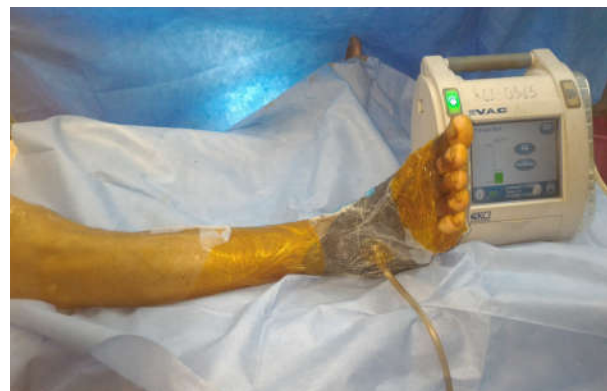
Fig. 3: The Npwt Dressing was Done Over The STSG