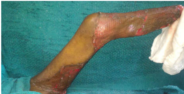
Fig. 6: The Raw Area Resurfaced with Split Thickness Skin Graft