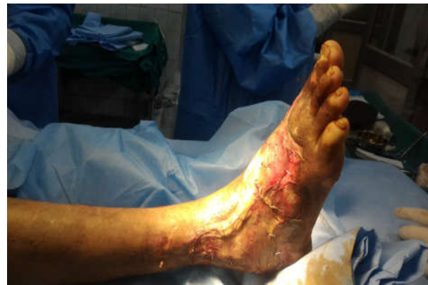
Fig. 2: The Raw Area Resurfaced With Split Thickness Skin Graft