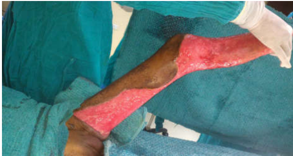
Fig. 5: Post Traumatic Raw Area Over Thigh And Leg