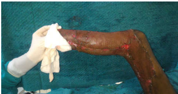
Fig. 7: The Raw Area Resurfaced with Split Thickness Skin Graft