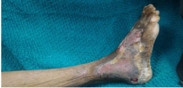
Fig. 4: Post Operative Day 7: Showing Almost 98% Graft Take