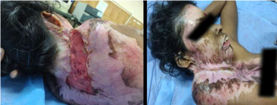
Fig. 1: At time of admission

This study was conducted in the Department of Plastic Surgery in a tertiary care institute. Informed consent was obtained from the patient under study. Department scientific committee approval was obtained. It is a single center, non-randomized, non-controlled study. The patient under study was a 27 year-old female, with no other known comorbidities presented with Post burn contracture in neck and right shoulder with Raw area at time of presentation (Fig. 1). She had restricted movement and difficulty in daily activities. X-ray of neck anteroposterior and lateral view done ruling out cervical vertebral dislocation (Fig. 2). Antibiotic treatment based on culture sensitivity and she underwent Debridement with Split Thickness Skin Graft (STSG) (Fig. 3) and Autologous Platelet Rich Plasma Injection (APRP). Post Operative Day 4 Graft assessment done with APRP injection (Fig. 3). After