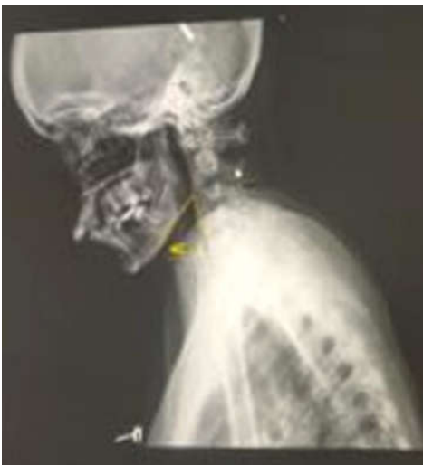
Fig. 2: Cervicomenal angle 46 at the time of presentation