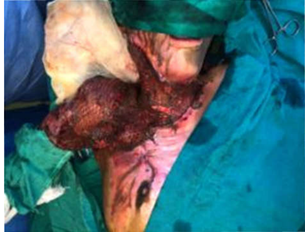
Fig. 5: Post Burn Contracture release and Skin grafting