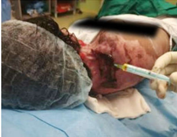
Fig. 4: Autologous Platelet Rich