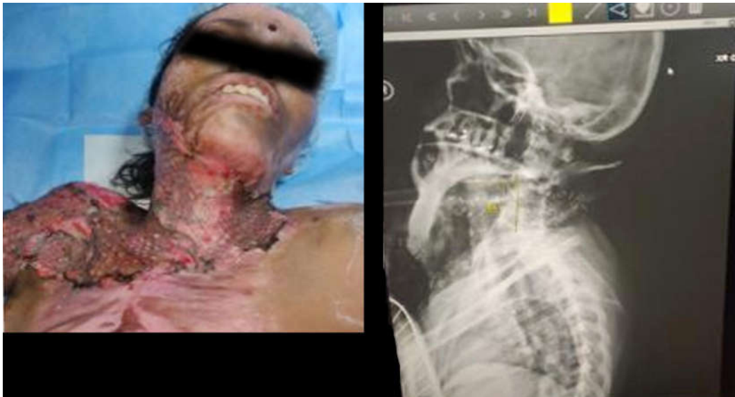
Fig. 6: Graft site assessment after 7 days and cervicomenal angle 84 degree extension

3 weeks Post Burn contracture release and split thickness skin grafting (Fig. 4) with APRP injection. Graft take good, cervicomenal angle improved to 84 degree at Postoperative day 7 (Fig. 6) and patient lost to follow up.