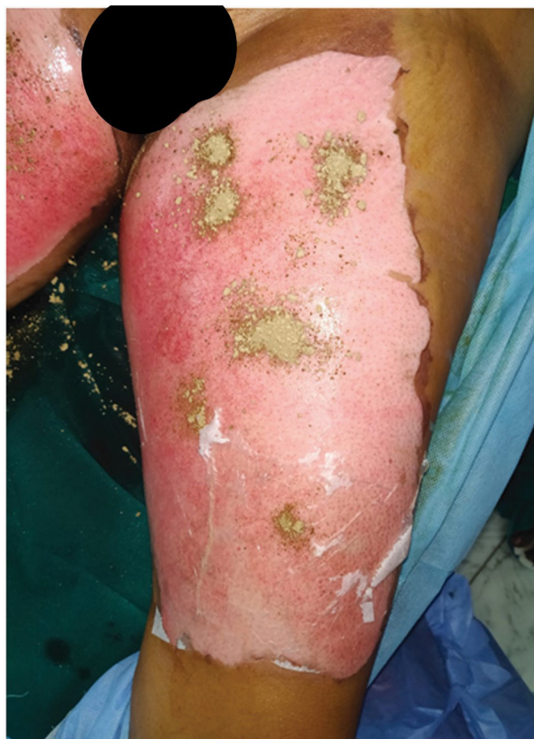
Fig. 2: Application of Centella asiatica on the wound over the anteromedial aspect of left thigh

This article is from the department of plastic surgery, JIPMER, Puducherry. After getting informed consent from the patient, clinical information and pictures are used in this article. A 45 year old female with no known comorbidities presented to the emergency department with alleged history sustaining scald burns by accidental spillage of hot water on her. Clinically her vitals were stable. She sustained first degree burns on her lower abdomen and anteromedial aspect of her both thighs (Figure 1). She was managed conservatively with daily cleaning and wound dressing with Cantella asiatica extract which is commercially available. Cantella asiatica extract was applied over the wound once in every 3 days for a period of 3 weeks (Figure 2 and 3)