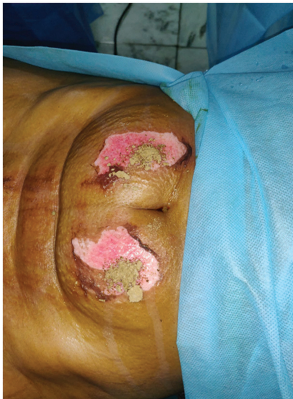
Fig. 3: Application of Centella asiatica on the wound over the lower abdomen