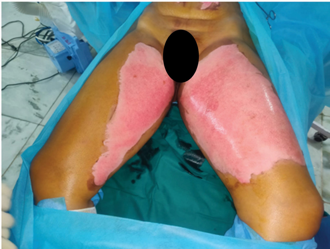
Fig. 1: A 45 year old female with first degree scald burns on her lower abdomen and anteromedial aspect of both thighs.

centella. In this article we discuss about the role of Centella asiatica extract in scald burns. The role of Centella asiatica extract in scald burns is due to its anti oxidant and anti inflammatory and collagen remodelling property. 6