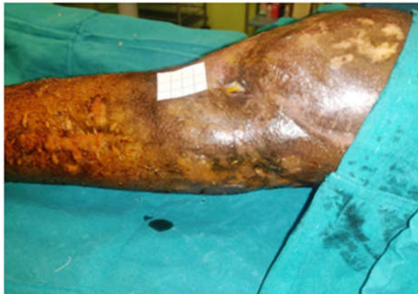
Fig. 8: Wound after hybrid reconstruction ladder

In our patient, the hybrid reconstructive ladder approach helped in a good wound bed preparation, helped to decrease the wound size, helped to decrease the duration of the hospital stay (Fig. 8).