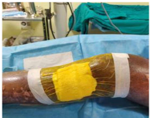
Fig. 7: Cyclic negative pressure wound therapy