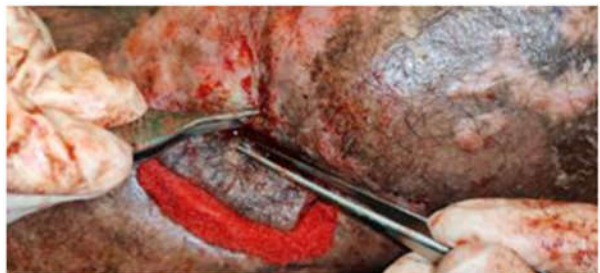
Fig. 6: Keystone flap