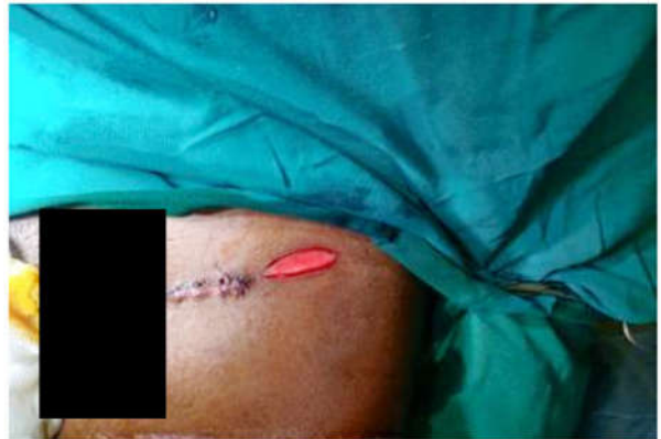
Fig. 4: Dermal graft harvesting