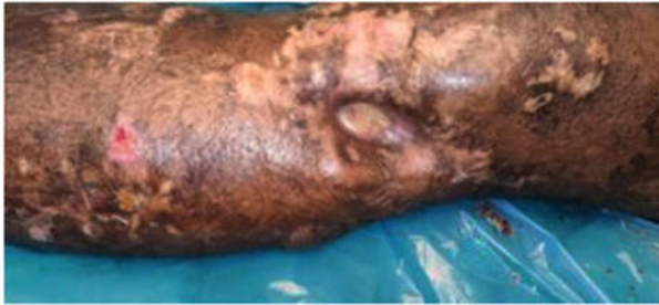
Fig. 1: Non healing ulcer at the time of admission.

grafting (Fig. 3), dermal grafting (Fig. 4, 5), local fascio-cutaneous flap like keystone flap (Fig. 6), cyclic negative pressure wound therapy (Fig. 7).