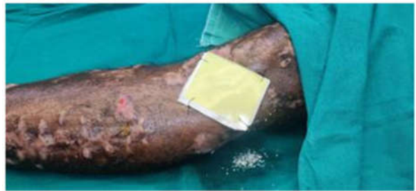
Fig. 2: Scaffold application