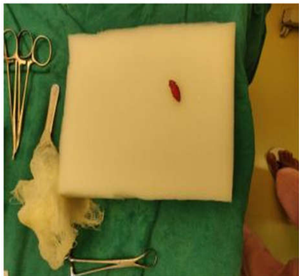
Fig. 5: Dermal graft