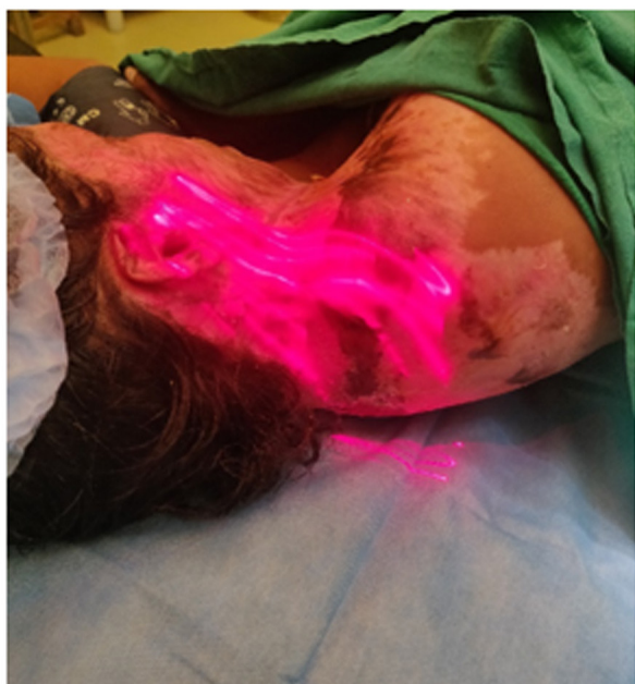
Fig. 3: Low level laser therapy