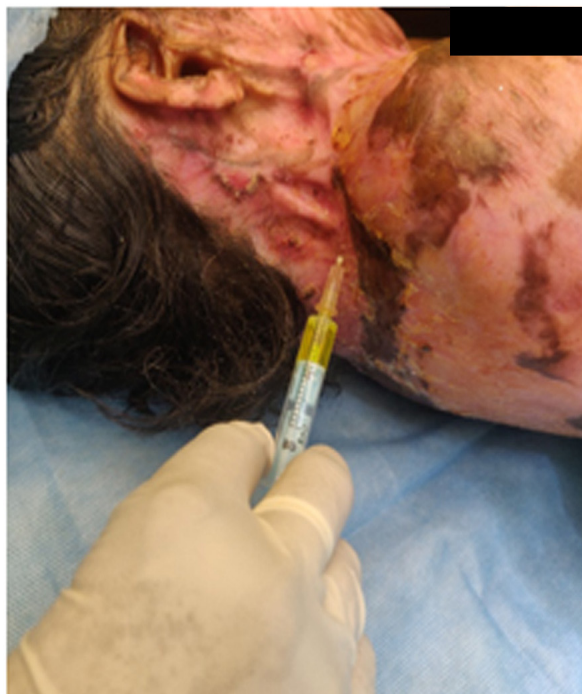
Fig. 2: Autologous platelet rich plasma