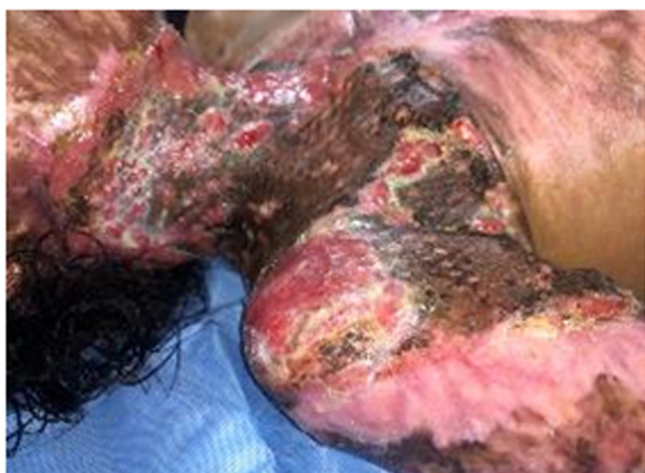
Fig. 5: Skin graft take after hybrid reconstruction ladder approach