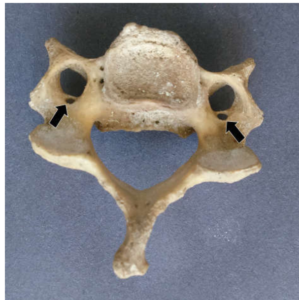
Fig. 2: Typical cervical vertebra showing bilateral double FT.