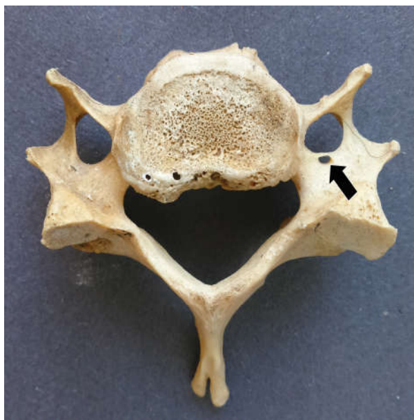
Fig. 1: Typical cervical vertebra showing unilateral double FT