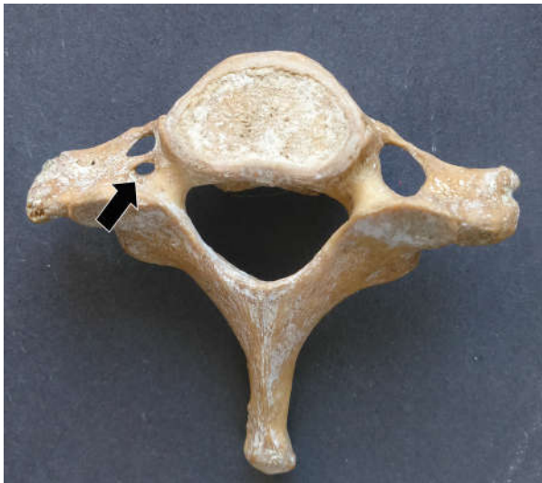
Fig. 5: Atypical cervical vertebra showing bilateral double FT.