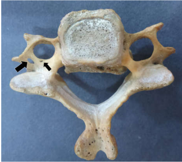
Fig. 3: Typical cervical vertebra (inferior aspect) showing triple FT.