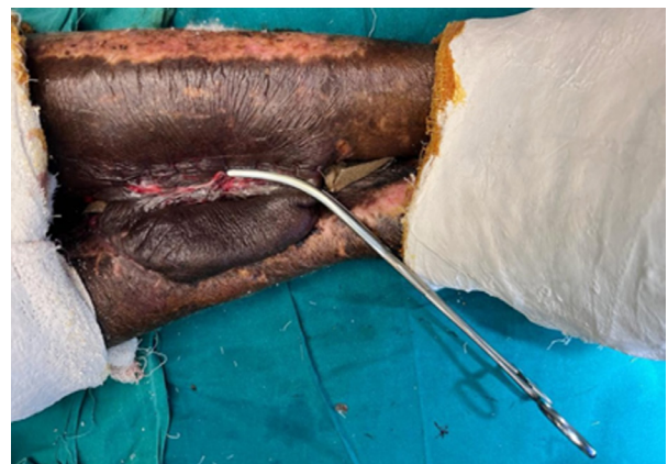
Fig. 4: Mechanical Clamping of the flap

Use of bowel clamp to clamp the vessels can be used as mechanical delay to further cause ischemia and improve the survival of flap (fig. 5).