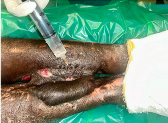
Fig. 5: Injection of adrenaline 1:10000 in the flap site No complications noted with above procedures.