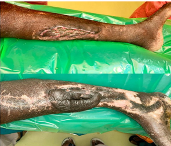
Fig. 6: Cross leg flap after division