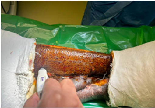
Fig. 1: Identification of Perforator of the cross-leg flap by doppler

male with post traumatic middle lower limb defect in the right side. On evaluation, Patient wound to have damaged lower limb vessels on angiogram. The surrounding skin was damaged and grafted where the bone defect was present. The local flap and free flap were not a possible option in this patient. Patient was planned on cross-leg flap for further management. After cross leg flap, patient was maintained in the appropriate position with the help of plaster of Paris cast. After three weeks, before flap division delay procedure was done.