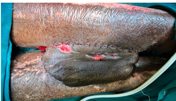
Fig. 3: Surgical delay by sequential cutting

We have tried various flap delay techniques in our case. The Surgical delay by perforator ligation, Pharmacological delay and Mechanical delay.