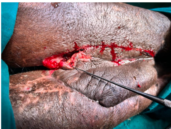
Fig. 2: Ligation of perforator

Skin, subcutaneous fat and fascia were cut layer by layer to induce the ischaemic preconditioning. (fig. 3).