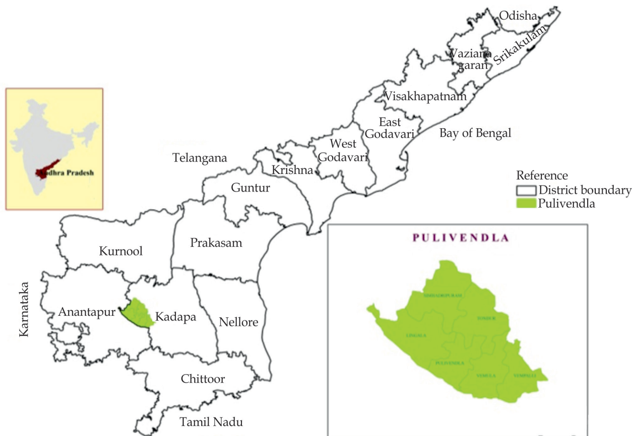
Fig. 1: Location map of Pulivendula tehsil, Andhra Pradesh.

outcrops (54135 ha of total area), interhill basins (6163ha of total area), undulating upper sectors, gently sloping middle sectors (39092ha of total area) and colluvial lower sectors (28542ha of total area) were identified.