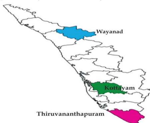
Fig 1: Selected districts of Kerala under study.

The randomly selected districts of Kerala for the present study is shown below (Fig.1).