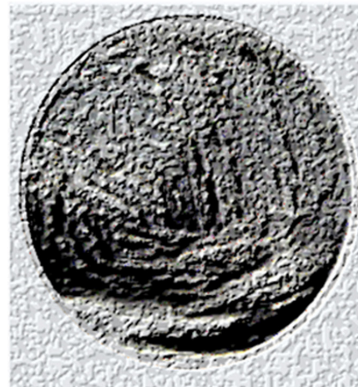
Fig. 5 and Fig. 6: The markings imprinted on the hard brass surface and wooden surface respectively.