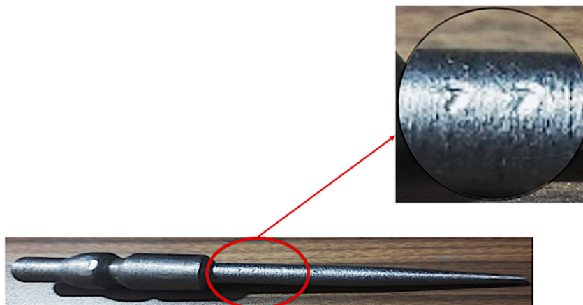
Fig. 2: Image of the specially designed firing pin engraved with micro-printed numbers with an enlarged view.

The present concept was to engrave a specific pattern on the firing pin's tip along with a serial number of the firearm on the firing pin's surface to provide a more sophisticated, accurate, and specific identification of the firearm from the fired cartridge case (Fig. 2). This will also help the investigators further in cases where the complete firing pin of the firearm is damaged or changed to misguide the investigator. Any such change can easily be pointed out by examining the serial number on the changed firing pin to serve as a strong clue of tampering with evidence.