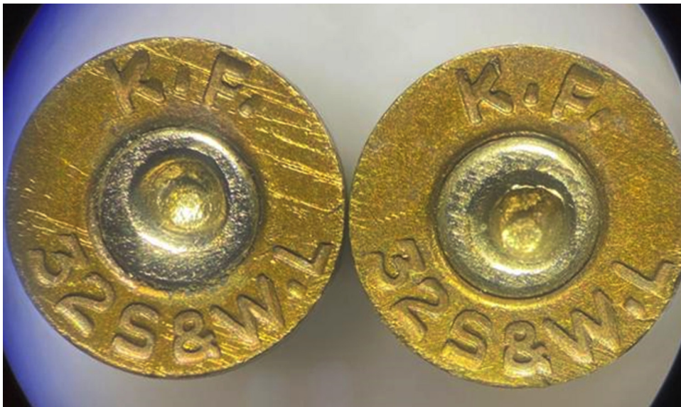
Fig. 1: Showing the Comparison of firing pin marks under Stereoscopic microscope, Created after firing over the percussion cap on 0.32 caliber cartridges.

the firing pin and further firing pin strikes forcefully on the percussion cap located at the base of the cartridge that bears the primary explosive material to initiate the firing. During this process, the firing pin leaves specific markings (Fig. 1) on the percussion cap that aids in the positive or negative identification of the alleged firearm during test firing. 5 However, these markings sometimes may be disturbed or destroyed deliberately by using any tool to misguide the investigation officer or ballistic expert. In such cases firing pin markings will not serve the purpose of identification. 6