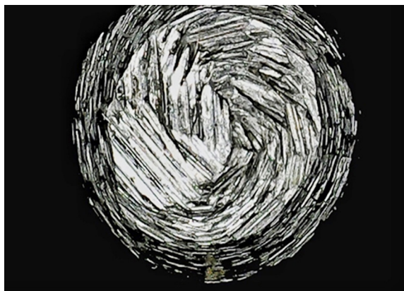
Fig. 3: The engraved markings at the tip of firing pin with the aid of Micro-Printing shown in magnified view under stereomicroscope.

firing, that specific pattern will be imparted on the percussion cap making it easy and specific for identification without much labor as shown in Fig. 3.