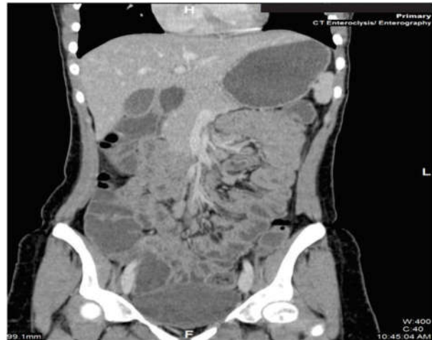
Fig.1: CT Enterography.

Diagnosis: Eosinophilic Gastro Enteritis - HPE Proven.