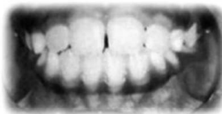
Fig. 6: Post-operative