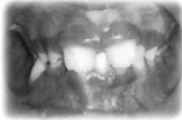
Fig. 1: Pre-operative

and space analysis was done to measure the arch length discrepancy. Clinical examination revealed Class I molar relation, with deep bite. 2x4 fixed orthodontic treatment was planned. Alignment was done using 0.012 NiTi stainless steel wire. Results were achieved in 2 months.