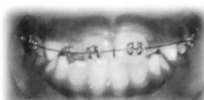
Fig. 5: Operative