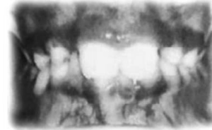
Fig. 3: Post-operative