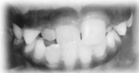
Fig. 4: Pre-operative

teeth and buccal tube was cemented on maxillary first permanent molars of both quadrants. 0.012 Round NiTi wire was used initially for alignment for 1 month followed by 0.014 NiTi wire for 2 months. One important modification done in this case was placing the bracket on the first premolar bilaterally till lateral incisors erupted in occlusion plane, then bonding it on both the lateral incisors. This was done to prevent debonding and extended length of treatment.