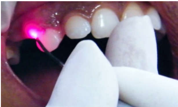
Crown lengthening by laser Nd;YAG