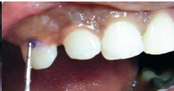
Depth of the marginal gingiva