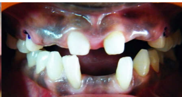
Recall check up