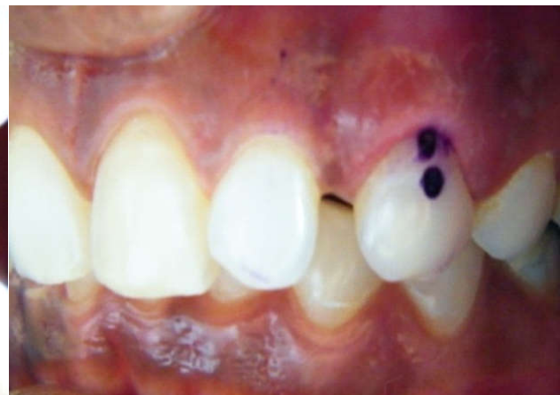
Recall check up