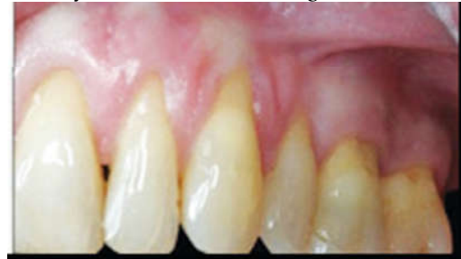
Fig. 1: Preoperative photograph, Showing Millers Class 2(2A).

sutured by means of 3-0 silk sling suture. 5