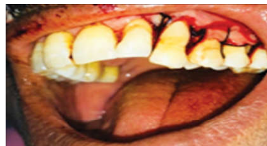
Fig. 4: Flap closure by 3-0, Silk sling suture.