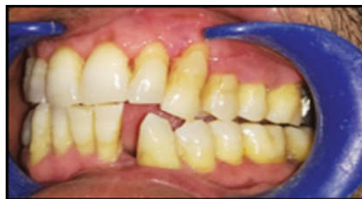
Fig. 5: Follow up 3 months showing, Complete root coverage.