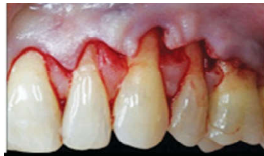
Fig. 2: Crevicular and papillary oblique incision.