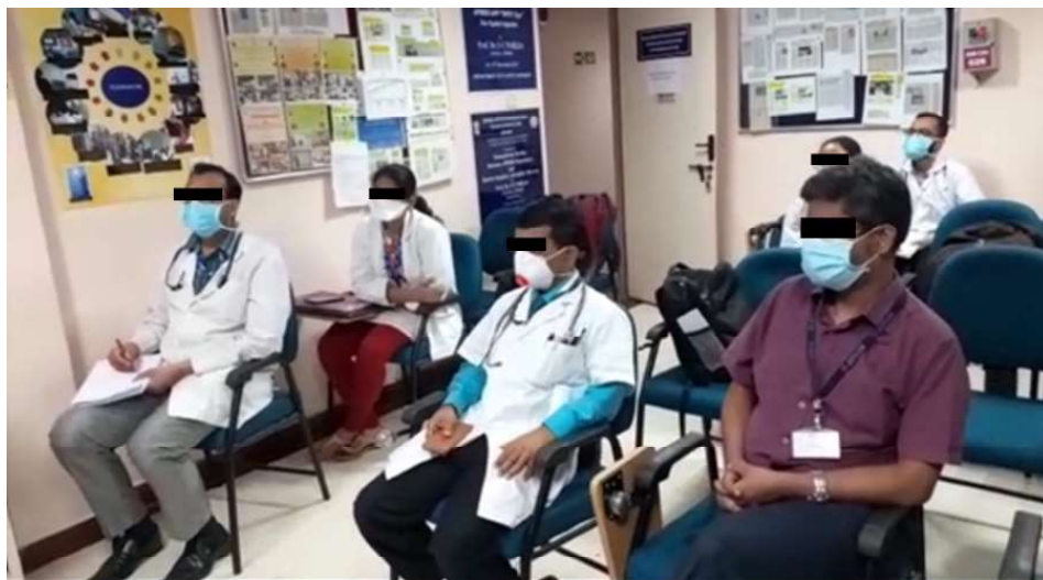
Fig. 1: Faculty and residents listening to class maintaining social distance

Distance learning is defined as: any educational or learning process or system in which the teacher and instructor are separated geographically or in time from his or her students; or in which students are separated from other students or educational resources. 3-5 Distance learning is a concept of learning that incorporates various technologies and media. Within the realm, different video, audio and computer tele-conferencing systems, and Computer Based Training, Computer Managed Instructional systems and other media