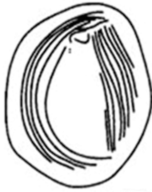
Fig. 1: (b) Line diagram of Chilodonella hexasticha