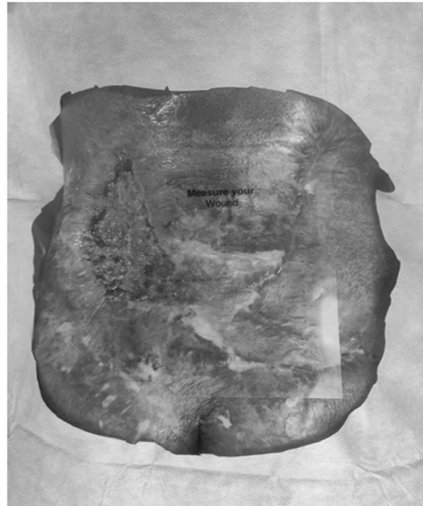
Fig. 2: Measurement of the wound with the stencil

routine investigation, the patient underwent a CT Dorsolumbar scan to rule out osteomyelitis. The ulcer on the back was excised and sent for histopathology to rule any malignant aetiology. After ruling out malignancy, patient underwent transposition flap for the raw area post excision. Post transposition distal part of the flap underwent necrosis for which debridement was done. The raw area post debridement was planned for further procedures for wound cover. The raw area was measured with the help of stencil (figure 2) with the markings in the X and Y axis and circular markings in the stencil will help in measuring the circumference of the irregular wound. The cost of the stencil is 200 Indian rupees easily available in all stationeries in Indian market.