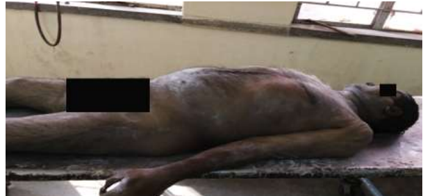
Fig. 3: The human cadaver after two days of injecting the raw formaldehyde the fluid absorbed

formaldehyde resulting in irritation of the mucous membranes of eyes and nose. But in the present world when donated dead bodies are extremely rare so to simply throwing it away is not ethically correct. But I suggest if necessary go for APR full face masks and do the procedure.