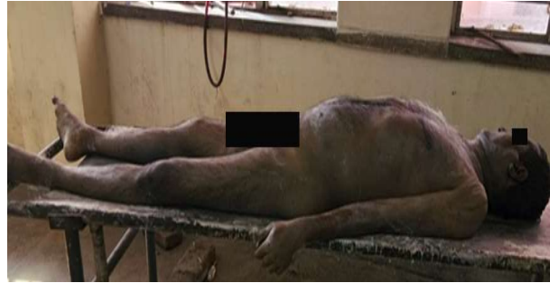
Fig. 2: The human cadaver after injecting the raw formaldehyde

Note: I rather not suggest to go for such methods as it poses direct exposure to the Raw