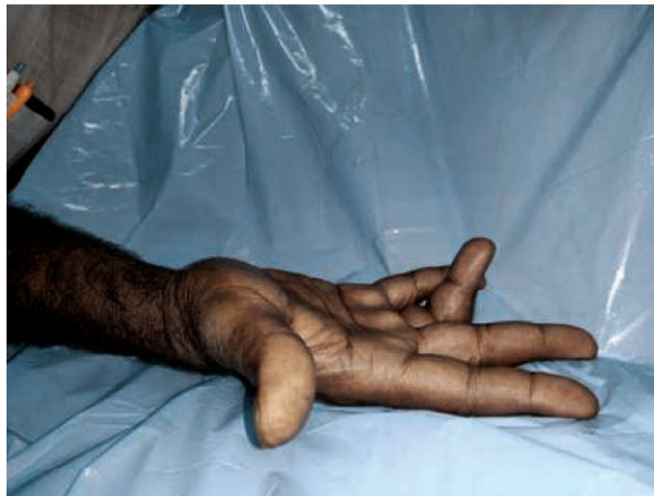
Fig. 1: Patient with flexion contracture of PIPJ of right ring finger

This study was conducted during the COVID -19 pandemic in a tertiary care center in the department of plastic surgery with departmental committee ethical approval. 48 year old gentle man with history of the hit of cricket ball on the tip of ring finger and had difficulty in movement of proximal interphalangeal joint (PIPJ) of ring finger with pain and edema of the finger 1 month back. Patient consulted the nearby indigenous treatment centre and treatment was done with massaging treatment. The patient developed pain on moving the finger and discontinued treatment after 1 week, the patient continued with daily activities and started noticing difficulty in movements of the ring finger, the patient showed to Dept. of Plastic Surgery and was diagnosed with injury to central slip and PIPJ capsule, with flexion contracture of the PIPJ and splinting and physiotherapy was planned for the patient. However in view of the COVID crisis, only