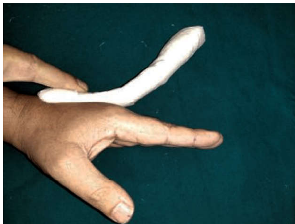
Fig. 2: Thermoplastic material modified into indigenous splint

emergency services were rendered in our hospital, hence we resorted to our own indigenous dynamic splint for the patient made from materials easily available in hospital. The splint was made with thermoplastic material which was given an angle of about 45 degree, a hammock made from rubber gloves, dynaplast, Velcrostraps, scissors. The splint was made and gave an extension vector at the PIPJ. The patient was advised to continue with the splint during day time and give rest during the night time. Patient was advised to be on follow up and definitive therapy once the COVID crisis resolves or when elective OPD restarts.