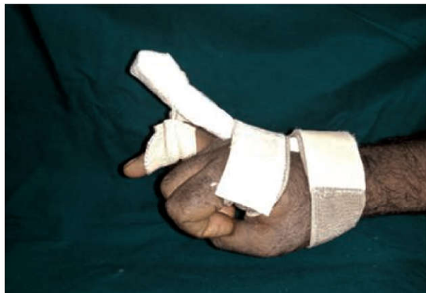
Fig. 4: Dynamic indigenous splint applied to patient