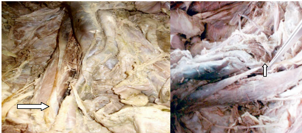
Fig. 2: Showing the psoas minor muscle tendonous part merged with iliopsoas fascia