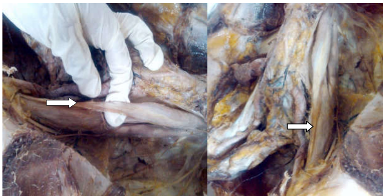
Fig. 1: Showing psoas minor muscle with long slender tendon