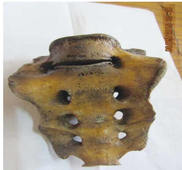
Fig. 4: Sacrum Showing Incomplete Lumbarisation of Sacral(S1) Vertebra.