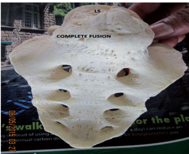
Fig. 2: Sacrum Showing Complete Sacralisation of Lumbar Vertebra.