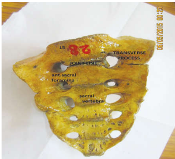
Fig. 1: Sacrum Showing Sacralisation of Lumbar Vertebra Complete on Right & Incomplete on Left.