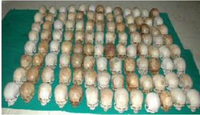
Fig. 1: Showing total number 105 dry adult Human skulls of either sex.