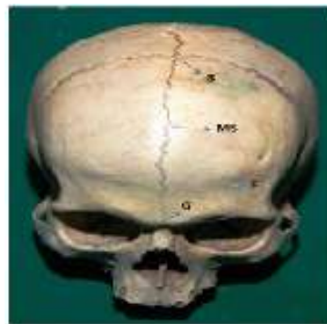
Fig. 3: Skull showing; B-Bregma, MS-Metopic suture, F-Frontal suture, G-Glabella.