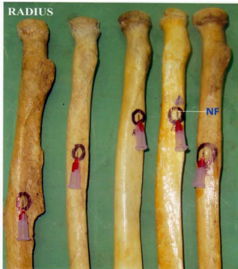
Fig. 3: Radius

(1967) 10 who found 62% of foramina located in the middle third of the bone and 36% in the proximal end. On the other hand, some reports such as those of Shulman (1959), Forriol Campos et al. (1987) 4 , Kizilkanat et al. (2007) 3 stated that the majority of nutrient foramina were located in the proximal third of the bone.