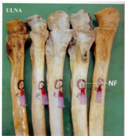
Fig. 4: Ulna Bones

In the present study, 72.2% of all radial foramina were on the anterior surface, of the bone. Such results were in accordance with the previous studies (Mysorekar, 1967; Forriol Campos et al., 1987) 10,4 who stated that the majority of nutrient foramina were located on the anterior surface of the bone.