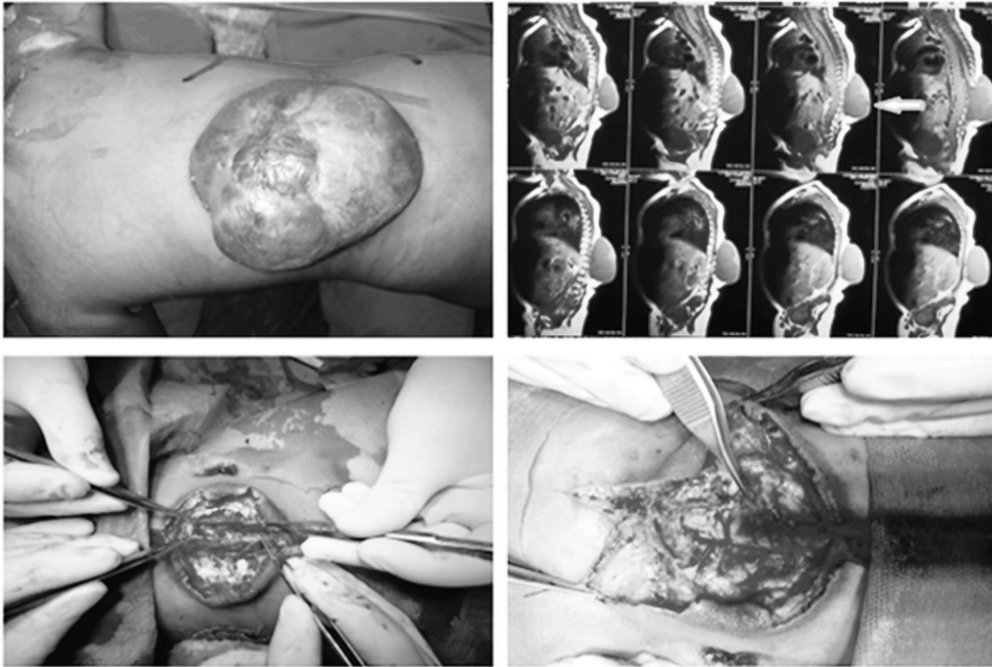
Fig. 1: Thoraco-lumbar MMC with hydrocephalus.