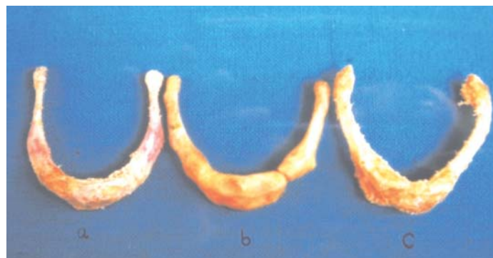
Photograph 1: Shapes of hyoid bone a) U-type) V-type c) Horse shoe type