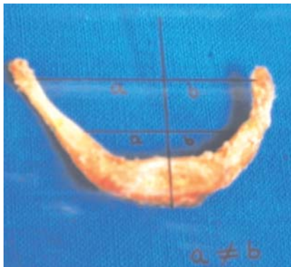
Photograph 4: An asymmetric hyoid bone