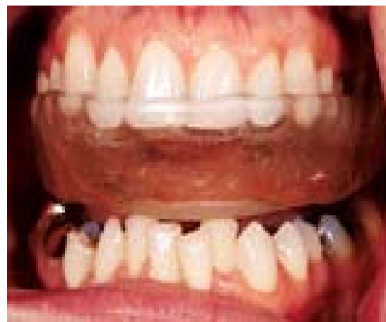
Fig. 9: If 4 mm increase in vertical height is not effective in reducing muscle hyperactivity, the height may be increased 12-15 mm. 8