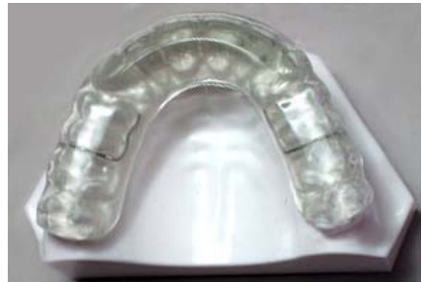
Fig. 3: Non-permissive or Directive occlusal splint.