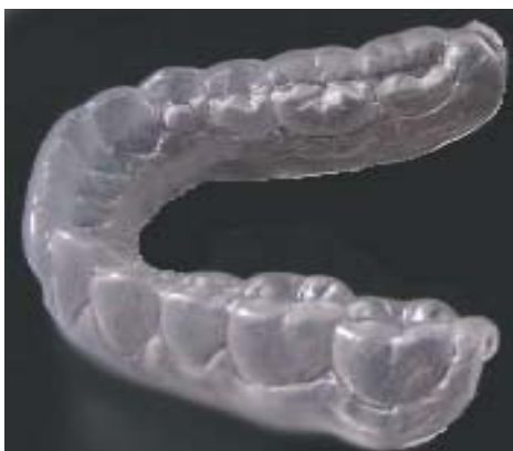
Fig. 4: Soft occlusal splint (made of PVC sheet).