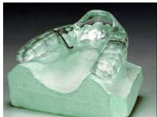
Fig. 6: Non-Permissive occlusal splint, these app. Direct the mandible in a more position (CR). 1 stable