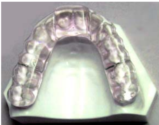
Fig. 2: Permissive occlusal splint.