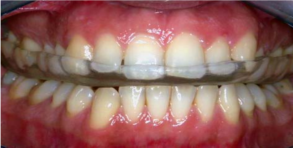
Fig. 1: Maxillary occlusal splint (in mouth).