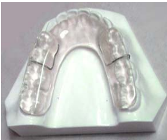
Fig. 8: If the patient demonstrates parafunctional movement in lateral and protrusive directions, a splint for the mandibular teeth will be effective (no anterior teeth coverage).