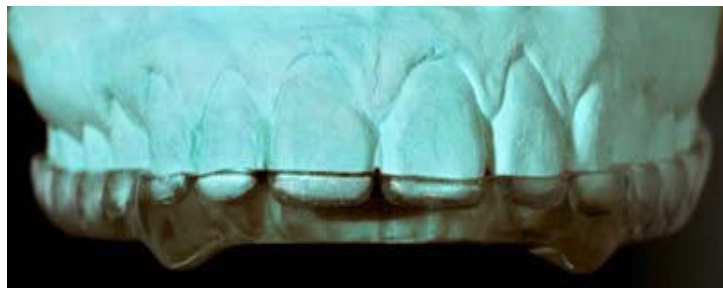
Fig. 7: Occlusal splint for muscle relaxation, this app. should have anterior guidance so that in all EC movements posterior teeth may disocclude.