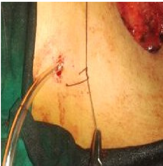
Fig 2: Making a first loop on to the skin