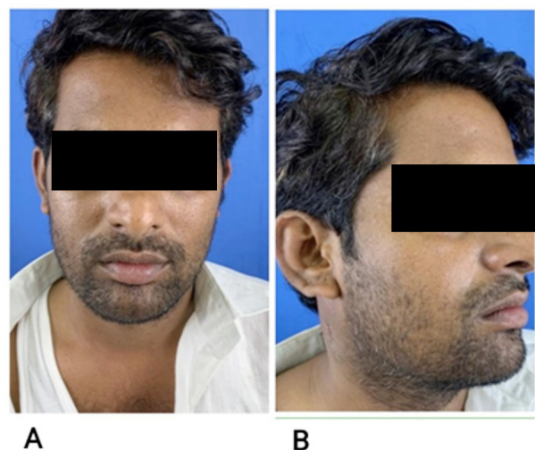
Fig. 4: Follow up clinical photograph on Post-Operative Day 40.

Regular dressings were done for a period of 28 days till the borders of the cavity naturally approximated following which secondary suturing was done. Raised blood sugar levels were managed by physicians throughout the hospital stay using fixed dose insulin and oral hypoglycemic agents. Patient was discharged on oral antibiotics on post operative day 29 and came for follow up on post operative day 40 showing drastic clinical and symptomatic improvement. (Fig. 4)