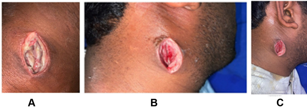
Fig. 3A: Wound image on post-operative Day 7. B: Wound image on Post-operative day 12. C: Wound image on Post-Operative Day 15.

Daily dressings of the cavity were done with mixture of Metronidazole Infusion IP (0.5%w/v) and Povidone Iodine Solution IP (10%w/v) wash and ribbon gauze soaked with Povidone Iodine Solution IP (10%w/v) was packed into the cavity. The edges of the cavity were digitally manipulated to drain out any residual pus. On post operative day 3 through microbiological reports we learnt that Gram staining of the pus showed plenty pus cells with Gram positive Bacilli and Gram negative Bacilli and Gram positive cocci.