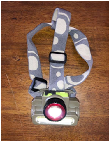
Fig. 1: Cost effective Head light source

head. This cost-effective head mount light is easily used with ease. (Fig. 2) It can be used for clinical examination in out-patient department, minor day care procedures, assisting surgeries and for performing any major or minor procedures and surgeries in plastic surgery.