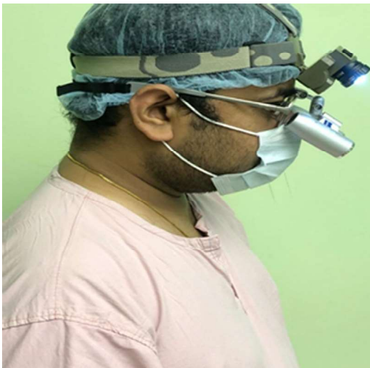
Fig. 2: Head light source with Magnifying loop

It is found to be easy to carry and useful in minor