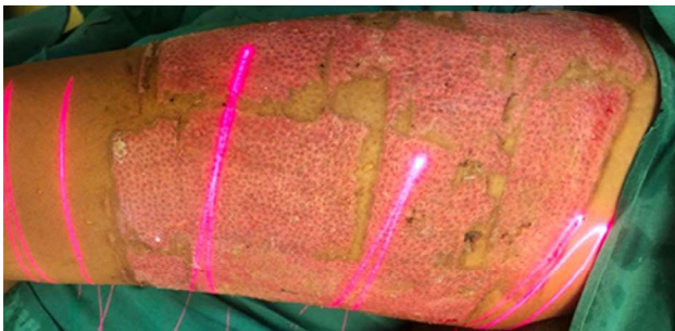
Fig. 2: Low Level Laser therapy

for a duration of 10 minutes once in a week. (Fig. 2). The second session was given to the donor site after 10 days, again for a duration of 10 minutes. The dressing for the raw donor site was done