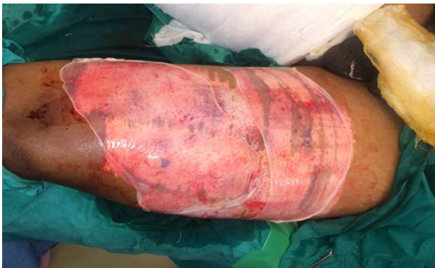
Fig. 3: Collagen application over the skin graft donor site

using collagen dressing. (Fig. 3) Negative pressure wound therapy was then applied onto the wound during closure. (Fig. 4)