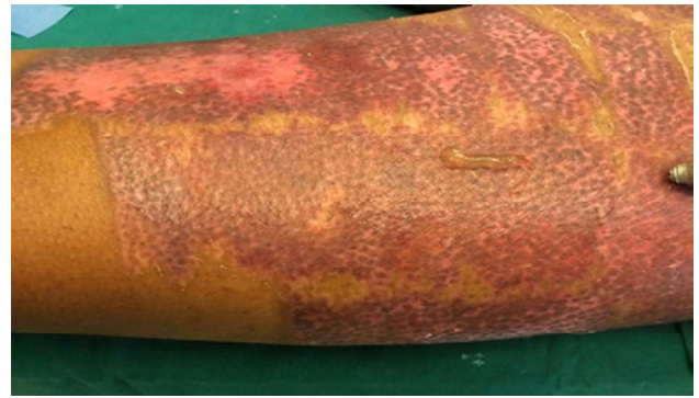
Fig. 5: Healed skin graft donor site on day 17

The skin graft donor site showed adequate healing by the regenerative technology application (fig. 5). Patient was compliant with all the above techniques we have used for regeneration. No complications were noted post procedure. Patient was discharged successfully.