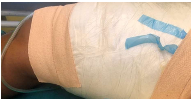
Fig. 4: Negative Pressure Wound Therapy over the skin graft donor site.