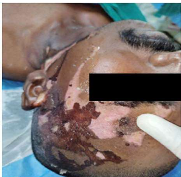
Fig. 2: Onion extract application

both upper limb and lower limb. Patient admitted in Burns ICU, managed with antibiotics, IV Fluids, analgesics. Dressings done, regenerative therapies done and scar management (like onion extract and silicone sheet) done (Fig. 2). VSS score at the time of admission was 6/13. ENT, Ophthalmology, Neurology, Psychiatry consultations done. At discharge wound healed well and Videodermoscopy done and scar VSS score at the time of discharge is 3/13.