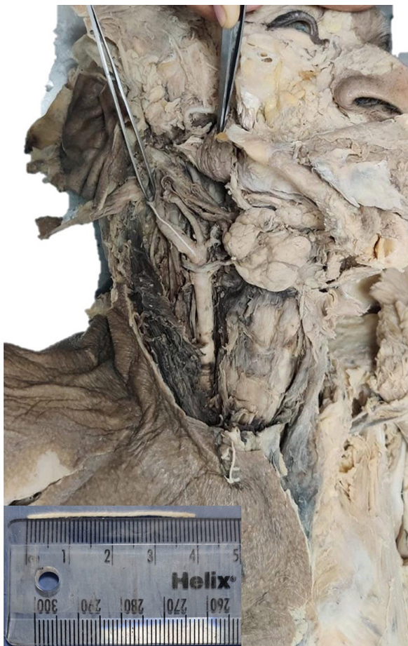
Fig. 1: Dilated (enlarged) Right Occipital Artery in a Cadaver

We have done H and E staining of the dilated (enlarged) part of the right occipital artery. We found fibro-intimal hyperplasia, fibrotic tunica media with calcification and infiltration. This suggests the changes due to chronic hypertension (Fig. 2). Masson's trichrome staining performed on the same tissue, confirmed the above-mentioned observations (Fig. 3).