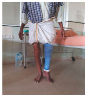
Fig. 5b: Fiberglass cast application after removal of ilizarov ring fixator healing of pin tract wound.