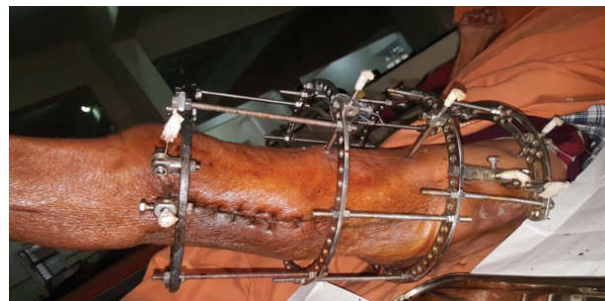
Fig. 3: Post-operative image after Ilizarov ring external fixator.