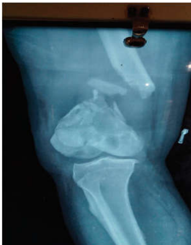
Fig. 1a: Compound left distal femur fracture.