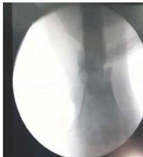
Fig. 5a: C-arm image after removal of ring external fixator.