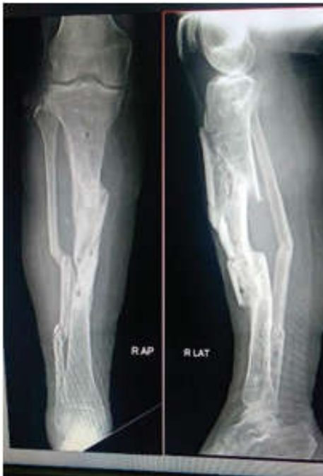
Fig. 7: X-ray of right tibia fibula after removal of Ilizarov ring external fixator removal.

Patient was with ring external fixator for 9 months and with multiple admission for distraction at proximal and compression at fracture site. Ring external fixator was removed after confirming callus formation at fracture site on radiographs of right tibia AP, lateral and oblique views. After removal of ring external fixator no movement at fracture site is confirmed by dynamic view under c-arm. Patient was able to walk from 2 nd day of Ilizarov ring fixator removal.