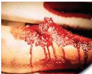
Fig. 1b: Clinical wound photograph.

Immediately after confirming left distal end femur fracture patient shifted to operation room stabilized the fracture with limb reconstruction system, wound debridement and femoral artery repair was done and skin defect was repaired 19 days after primary procedure with split thickness skin graft and patient got discharged after confirming of taking up of skin graft.(Fig. 1a and 1b)