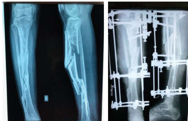
Fig. 6a: X-ray right tibia fibula after removal of AO external fixator.

After 1½ month patient came with the complaint of pus discharge from the pin tracts and repeat x-rays showed no signs of fracture union and diagnosed as infected fracture non-union of right tibia. AO external fixator removed and Ilizarov ring external fixator applied. Patient got discharged 12 days of Ilizarov fixation.(Fig. 6b and 7)