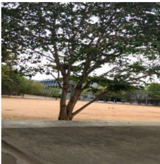
Plate-2: Study Area.