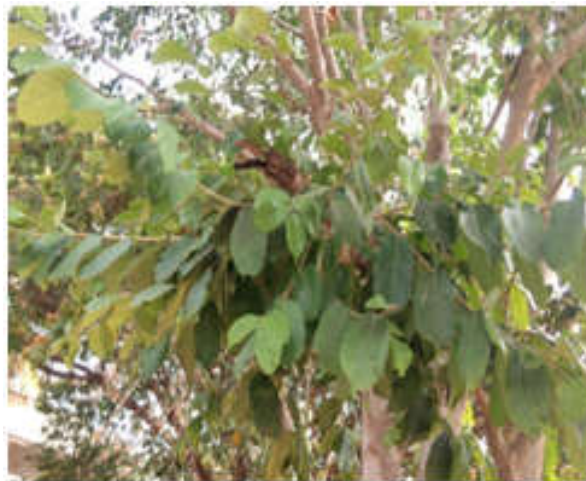
Plate-3: Habit of Holoptelea integrifolia .

The seeds of Holoptelea integrifolia were collected for the present study. Holoptelea integrifolia , Planch. was selected in Nirmala College campus to find out the qualitative phytochemical and mineral analysis of the seeds of Holoptelea integrifolia were analysed. Seeds were collected during the month of April. The data were then processed and represented in tables and chart.