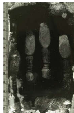
Fig. 2: Developed Latent Fingerprints.