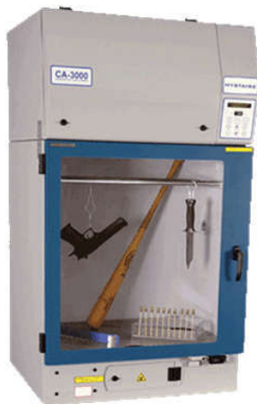
Fig. 1: Superglue Fuming Chamber.

A Mechanistic Model for the Superglue Fuming of Latent Fingerprints: The use of superglue vapours to detect latent fingerprints is known as superglue fuming. The role of the fingerprint material in the process, leading to formation of methyl cyanoacrylate polymer at the site of the fingerprint, remains to be established. Films of liquid alkanes respond similarly to actual fingerprints in the fuming experiment. Their responses depend on the hydrocarbon used, viscosity, and film thickness. Factors such as film thickness appear to be relevant for actual fingerprints as well. (Fig. 2) A model was proposed in light of these observations. The model compares the process with gas chromatography, in which molecules partition between the gas phase and a stationary phase. (Fig. 1 and 3) Aspects such as accumulation of superglue monomers by partitioning into a thin film (or wax) are consistent with the preferential response of fingerprints on surfaces relative to the background. 4